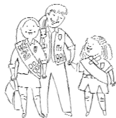
Girl Scout Cookie Time

The Girl Scout troops that meet here at Hope are participating in " Cookies from Home ". They will be taking donations of any amount, preferably $3.50 (the cost of a box of cookies) or $7.00, etc. to purchase boxes of Girl Scout cookies to send to the military troops stationed throughout the world. The Girl Scout council is working with USO to ship them and distribute them to our soldiers. A Girl Scout cookie display will be set up here at Hope on Sundays, February 10 & 17. Please help with this very worthwhile cause. You may also purchase cookies for yourself at these times. Please contact LuAnn Smith at 610-760-9576, or Karen Zimmerman at 610-760-1887 or Natalie Savage @ 610-767-8569 for more information.