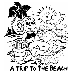
A TRIP TO THE BEACH!

Youth and adults are signed up for our annual trip to the New Jersey shore. This year the trip is from Friday, July 18-Sunday, July 20 th . A