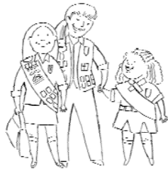
Girl Scout Cookie Time