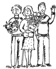
Gracedale Easter Visit