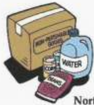
Northampton Area Food Bank

Proceeds will be divided between The Northampton Area Food Bank and The Hope Lutheran Church Good Samaritan Fund