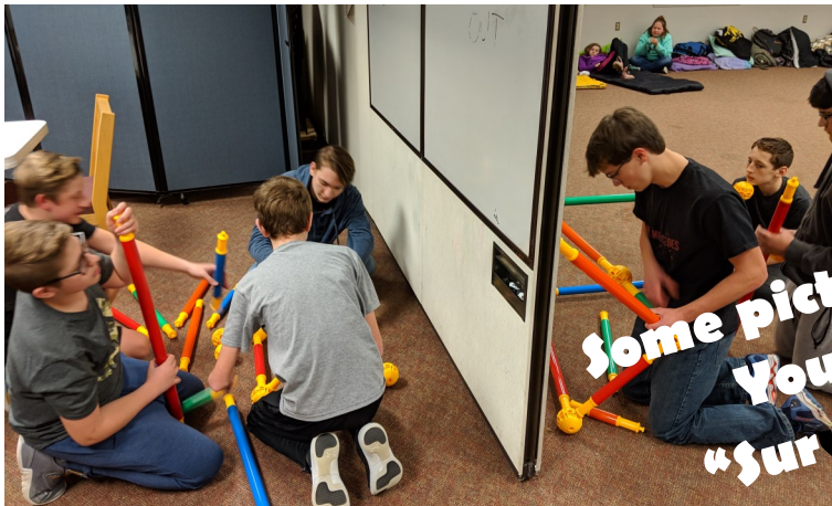
Some pictures from the Youth Group "Survivor" Event