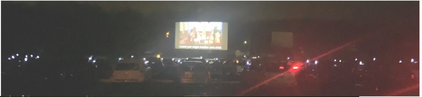
Candles being held out car windows during singing of SILENT NIGHT