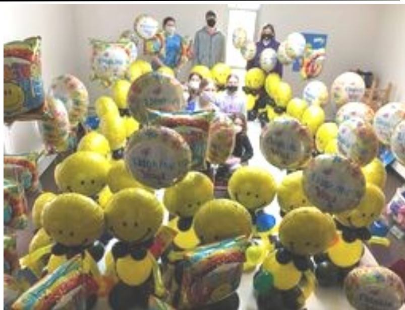
Balloon Buddies put together by Youth Group for STAR members.