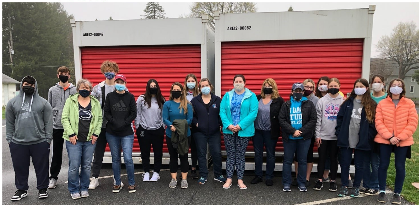
Group ready to load the truck! Thank you to everyone who supported the 40 Day—40 Item Clothing Drive.